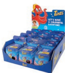
Magic Bath pink - Individual 12 x in a counter display