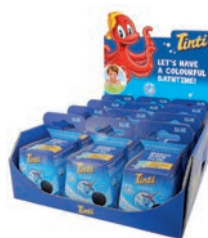
Magic Bath blue - Individual 12 x in a counter display