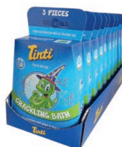
Crackling Bath - 3 pack 10 x in a tray