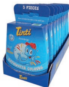
Bathwater Colours - 3 pack 10 x in a tray