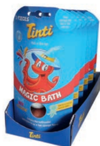
Magic Bath - 3 pack 6 x in a tray