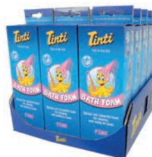
Bath Foam pink 15 x in a tray