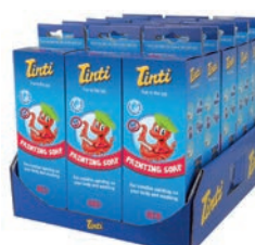
Painting Soap red 15 x in a tray