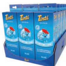
Painting Soap blue 15 x in a tray