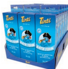
Bath Foam blue 15 x in a tray